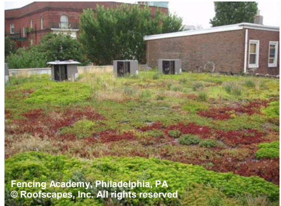
Fencing Academy, Philadelphia, PA