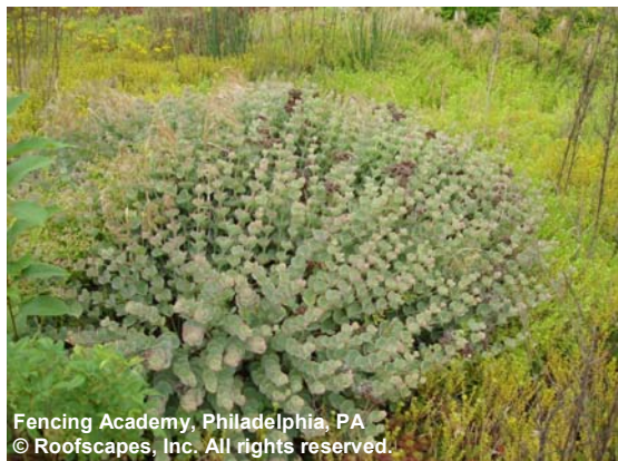
Fencing Academy, Philadelphia, PA